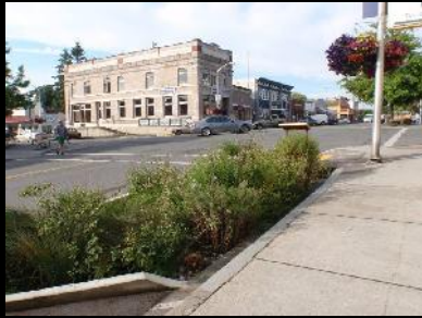
Rain garden / sidewalk swale