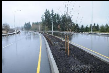
Highway median treatment